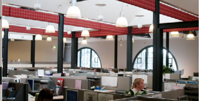
Soundmask transducers blend in with the light fittings