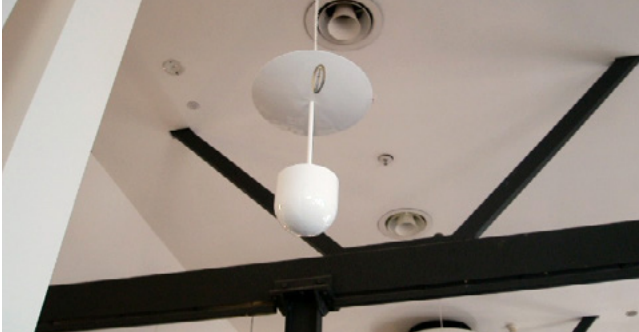
Soundmask transducer and acoustic disc in place