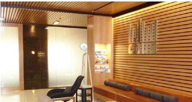
Reception area and foyer next to board room