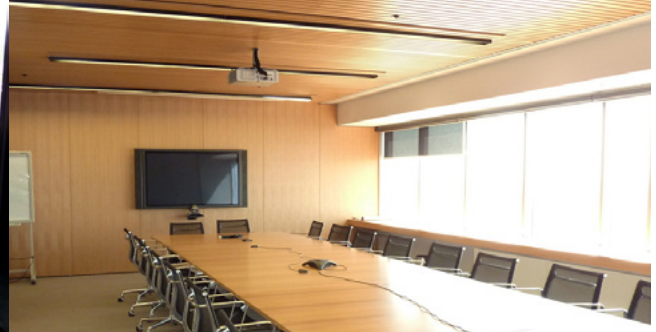
Board room with unique wood panelled ceiling