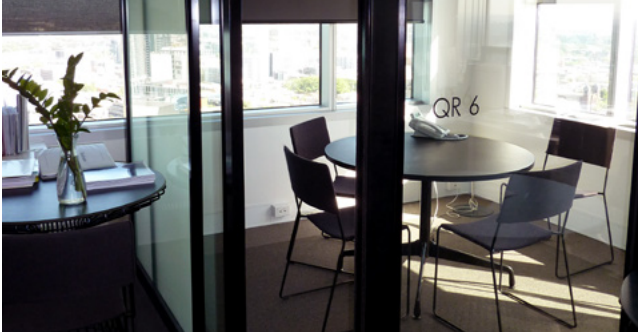
Glassed in meeting room within open plan area