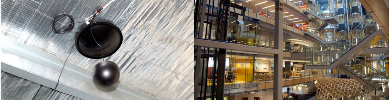
One of the 2000 transducers installed with acoustic discs